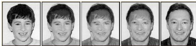
Fig 1: Cross Dissolve