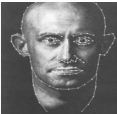
Fig 4: Field Morphing

The user has to provide the algorithm with a set of control line segments. The segments serve to align the features of images A and B. The more control line segments there are, the more control the user has over these shape changes. For faces, for example, the line segments can be drawn over the contour line segments of the head, the ears, the eyes, the eyebrows, the lips, the nose, and so on.