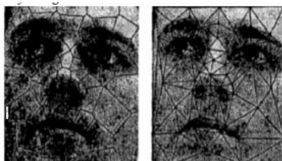
Figure 3: Triangulation of a face image using 80 distinct points. a) Voronoi diagram. b) Delaunay triangulation.

A few distinctive triangulation procedures can be utilized for triangulation of a lot of focuses. Triangulation of a lot of focuses is a procedure that is done in PC illustrations [15]. Delaunay triangulation [16] is a well known technique for ideal triangulation of a lot of focuses. To compute the Delaunay triangulation, Voronoi locales [16] ought to be acquired. Various immediate and backhanded development techniques are accessible for the Delaunay triangulation. The strategy that is received in this work is the blend of the quality triangular work age proposed by Ruppert [17] and the partition and vanquish steady Delaunay triangulation proposed by Guibas and Stolfi [16]. These two triangulation procedures have been accounted for to produce more exact outcomes than the current partners and to be quicker than them. A triangle is coded by its location (position) in the diagram. Voronoi chart and Delaunay triangulation of an example face picture is appeared in Figure 3. A lot of 80 unmistakable focuses are utilized for calculation of the Delamay triangulation.